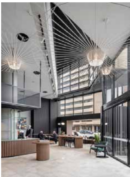
↑ 26 Flinders Street, Adelaide SA