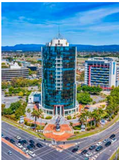
↑ Corval Corporate Centre Trust