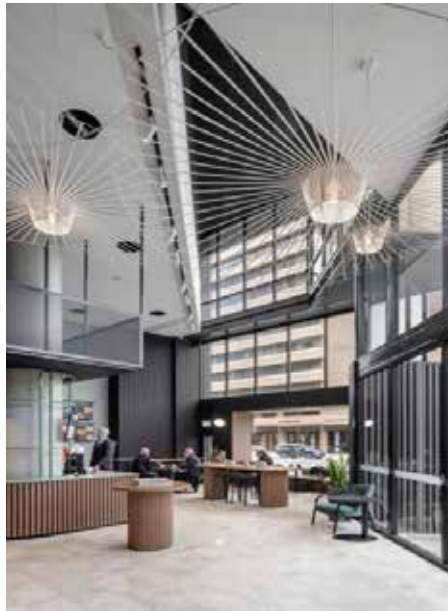
↑ 26 Flinders Street, Adelaide SA