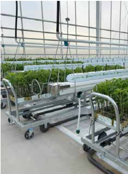
↑ Corval Glasshouse Fund